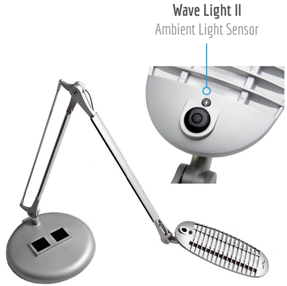
Wave Light II Powered Base