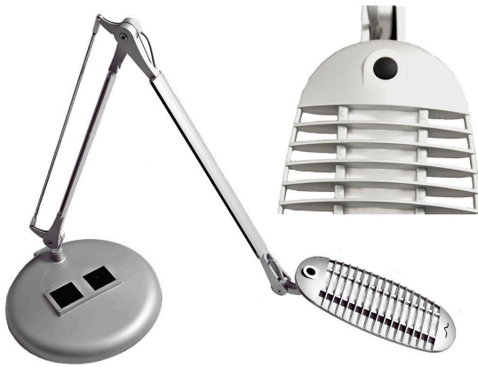
Wave Light I Powered Base