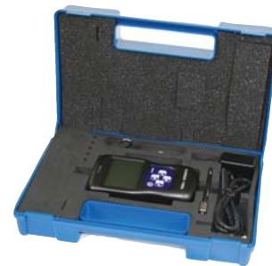
FG-3000 with Accessories in Protective Carrying Case